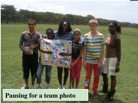
Pausing for a team photo