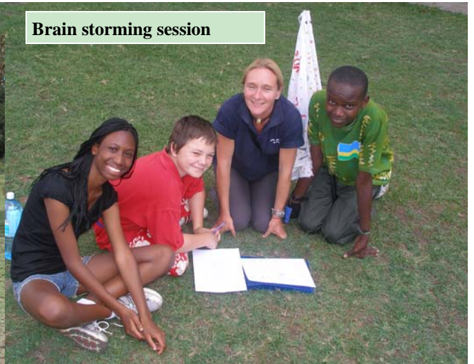
Brain storming session