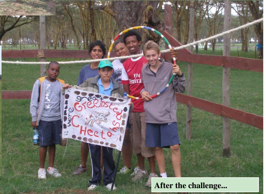
After the challenge...