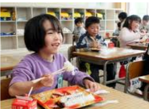
School meal provided using the donated fund (May,2011)

On March 11th 2011, the eastern part of Japan was hit by an unprecedentedly massive earthquake and Tsunami.